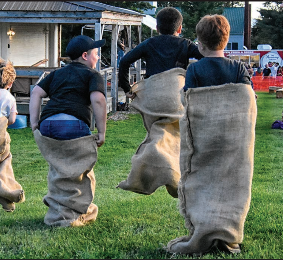
Some youngsters have the knack of jumping, others do well to keep their burlap sacks up. Children at the Old Stone House kept themselves amused Saturday by staging impromptu races.