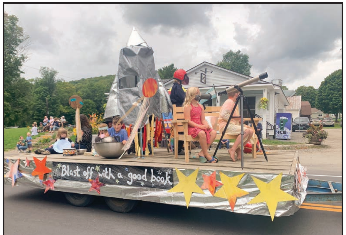
Along with the fire trucks and other emergency vehicles a float created by the Albany Public Library drifts along the parade route encouraging everyone to read.