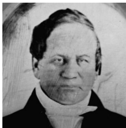
Alexander Lucius Twilight.

2020 marks Alexander Lucius Twilight's 225th birthday. Mr. Twilight was the headmaster and minister of the Orleans County Grammar School through the 1830's, '40's and '50's. He was a community and educational leader, a member of the Vermont House of Representatives and a man of incredible intelligence and will. He was also African American and the first black man to graduate from a United States college (Middlebury) and serve in a state legislature. This year marks the first of many celebrating the legacy of this important man.