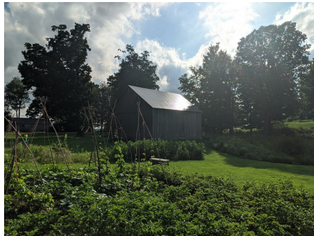
One of the spots which makes up the Giving Garden.

To mitigate the negative impact of food insecurity in our region, which has been further amplified by the COVID crisis, we expanded our Historic Kitchen Garden two-fold. The produce from the Giving Garden, as it has been dubbed, is given to local food pantries or distributed across the county with the help of Green Mountain Farm-to-School. Volunteers, AmeriCorps members and staff have worked to ensure that our community has access to the organic fresh fruits and veggies from the museum's garden spaces.