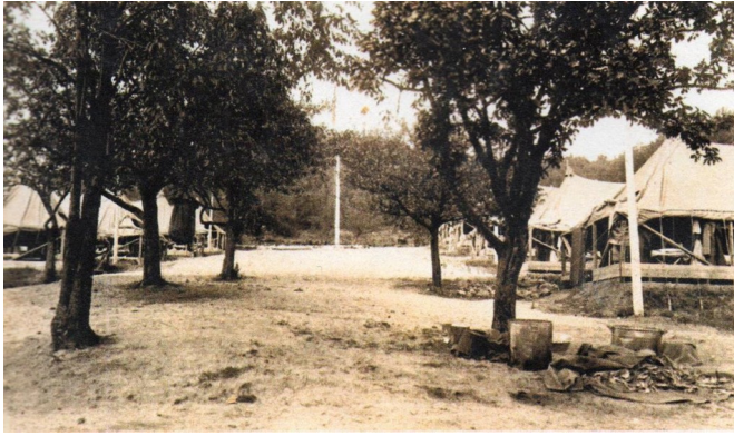
Civilian Conservation Corps Camp 55.